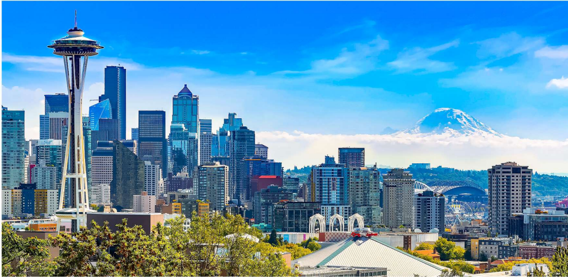
PHOTO SHOOT PRICING